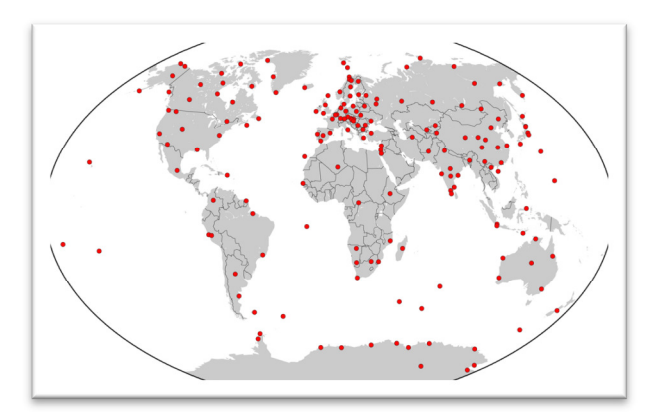
Fig. 2. The Distribution of Magnetic Observatories around the world.

A glance at the map of the distribution of magnetic observatories around the world shows a relative lack of observatories in the Southern Hemisphere [Fig. 2]. As a result, models of Earth's magnetic field are weaker in the Southern Hemisphere and the ability of space weather experts to predict the intensity and evolution of space weather events also weaker. Placing additional magnetic observatories in the Global South would improve space situational awareness.