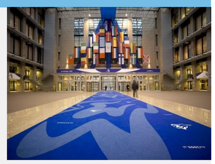
Inside the building for the Council of the European Union in Brussels where the code of conduct has been drafted.